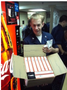
This right here is what it's all about! Picture from our USS Crommelin adoption.

"We were able to send our love to many more because of special people like you."