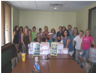
JUNE 24, 2010 Central FL Moms Packing Party