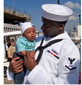
This right here is what it's all about! Picture from our USS Crommelin adoption.