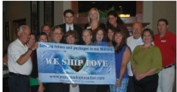
Troy, IL Troy/Maryville/St. Jacob Chamber of Commerce

"We were able to send our love to many more because of special people like you."