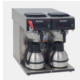
Texas / Bunn Coffee / 3000 Coffee Filters for our EOD's!!!