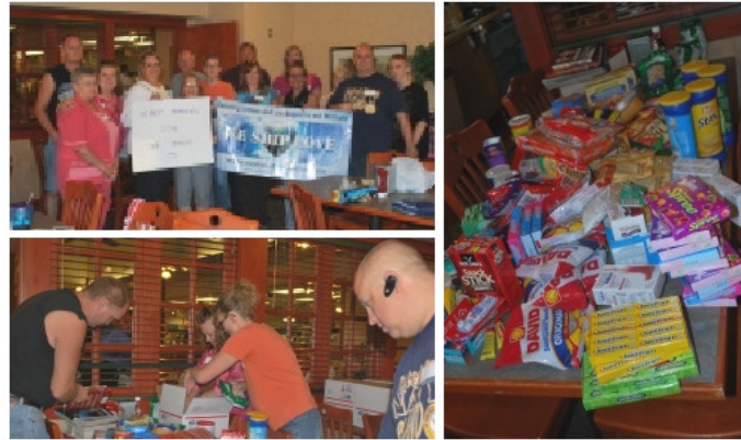
JULY, 2010 IL Moms Packing Party